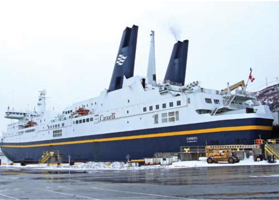
MV Caribou loading at Port-aux-Basques for voyage to North Sydney